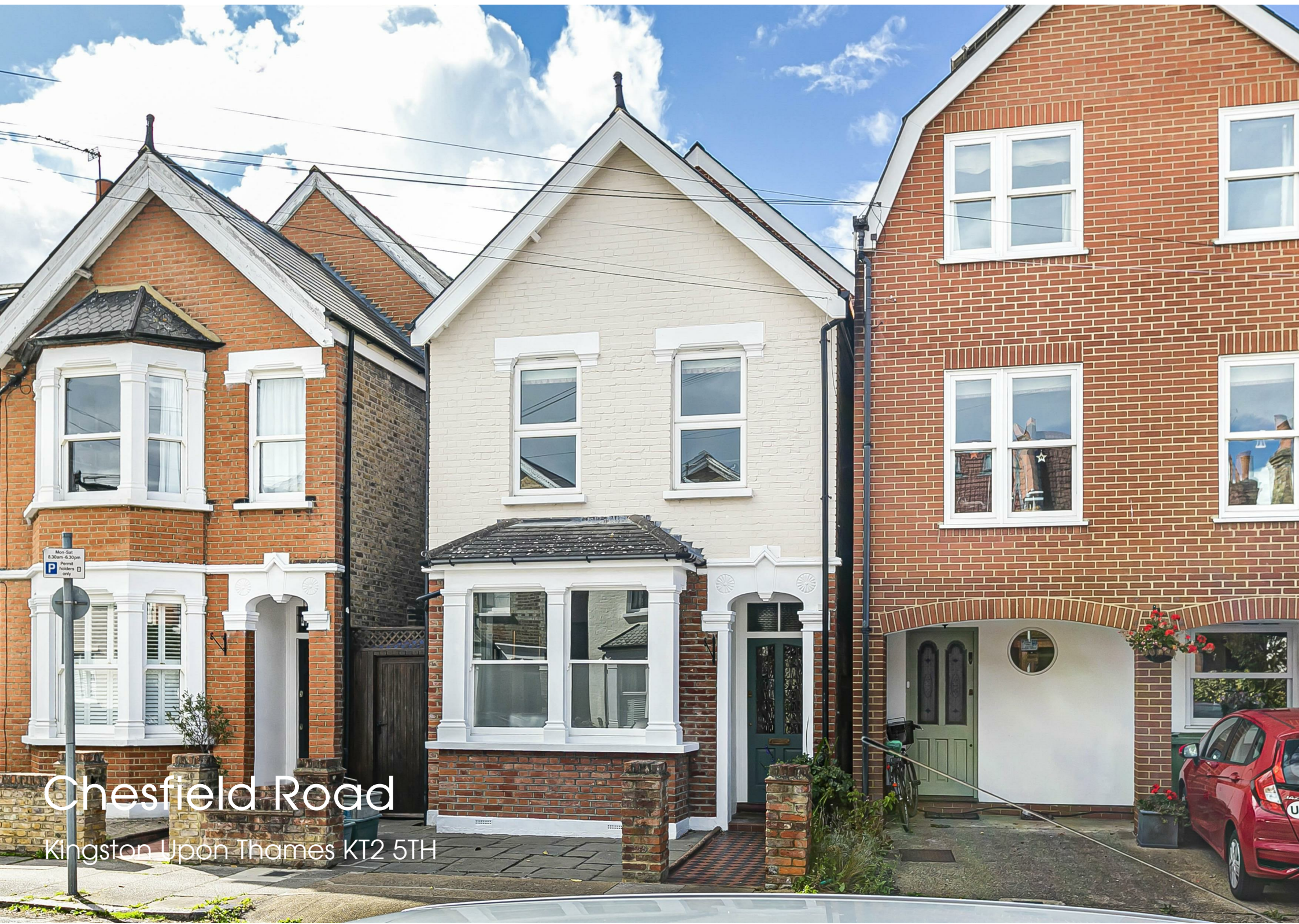
Chesfield Road Kingston Upon Thames KT2 5TH